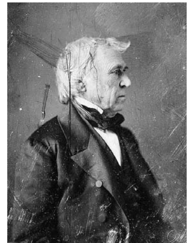
Zachary Taylor prepared for the Mexican invasion during the Mexican-American War in Corpus Christi.